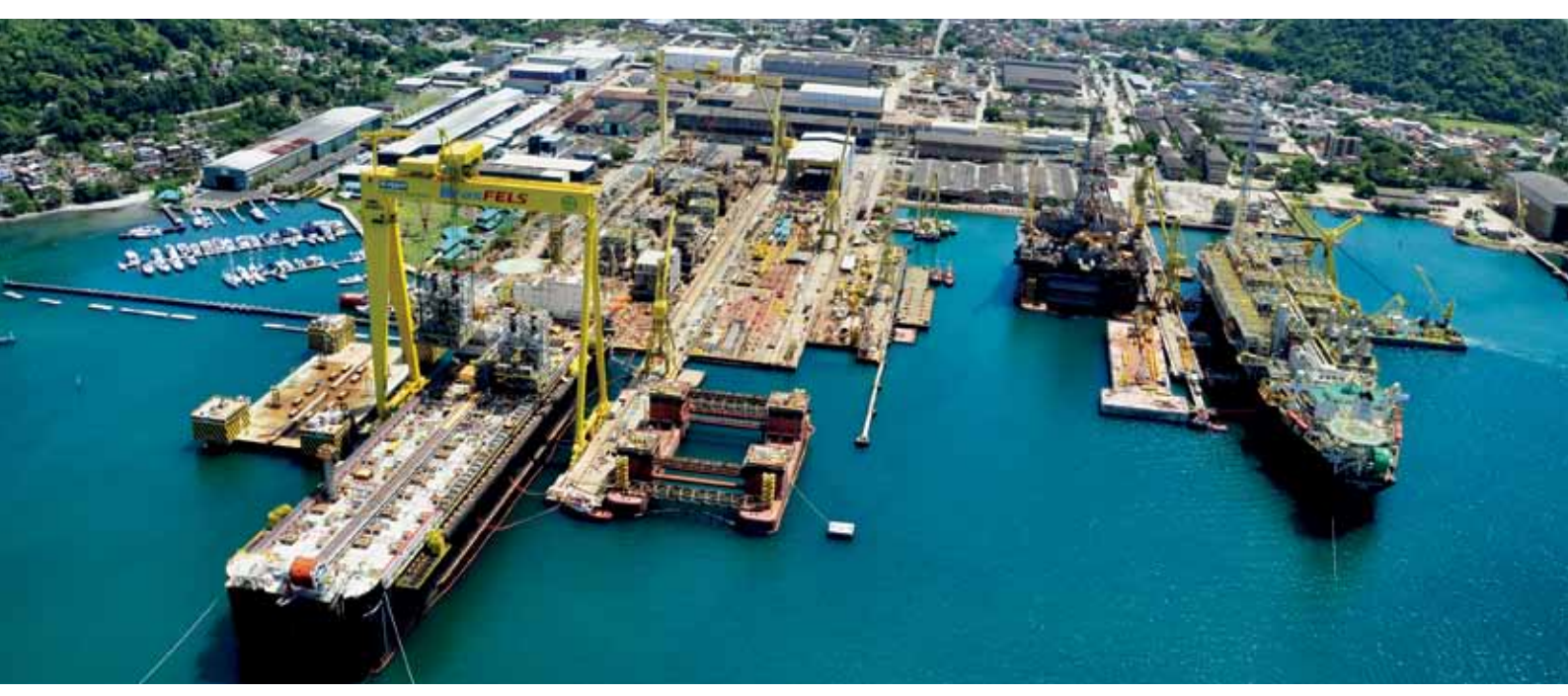
BrasFELS completed the first lifting campaigns for two Floating Production Storage and Offloading (FPSO) vessels in January

Similarly, the first lifting campaign was successfully carried out for Petrobras FPSO vessel, P-66, in January. BrasFELS' 2,000-tonne gantry crane was utilised to carry out the lifting for the modules. The project is on schedule for the second and third lifting campaign in February and March respectively. In addition to the installation and integration of topside modules, BrasFELS also fabricated some of the modules.