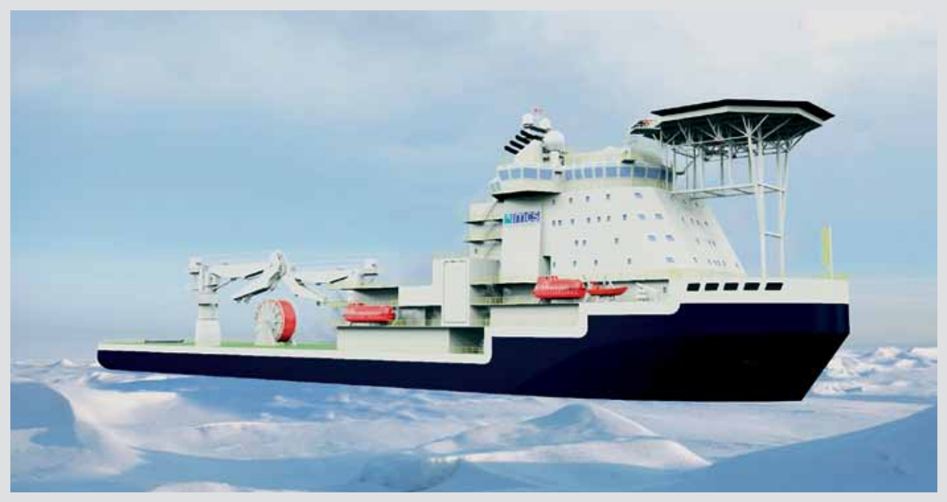
Keppel Singmarine has been contracted to build an ice-class multi-purpose vessel for New Orient Marine Pte Ltd

Keppel Singmarine has secured a contract from New Orient Marine Pte Ltd, a subsidiary of Luxembourg-based Maritime Construction Services SA (Maritime Construction Services), for an ice-class multi-purpose vessel.