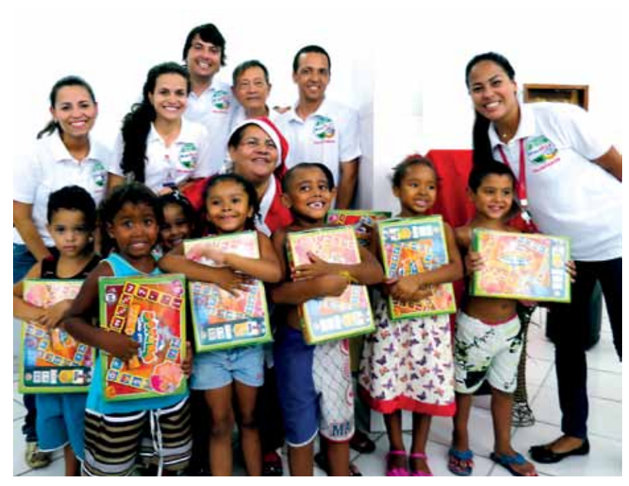
Keppelites from BrasFELS brought festive cheer to the children and youth at a learning and recreational centre at Morro da Cruz