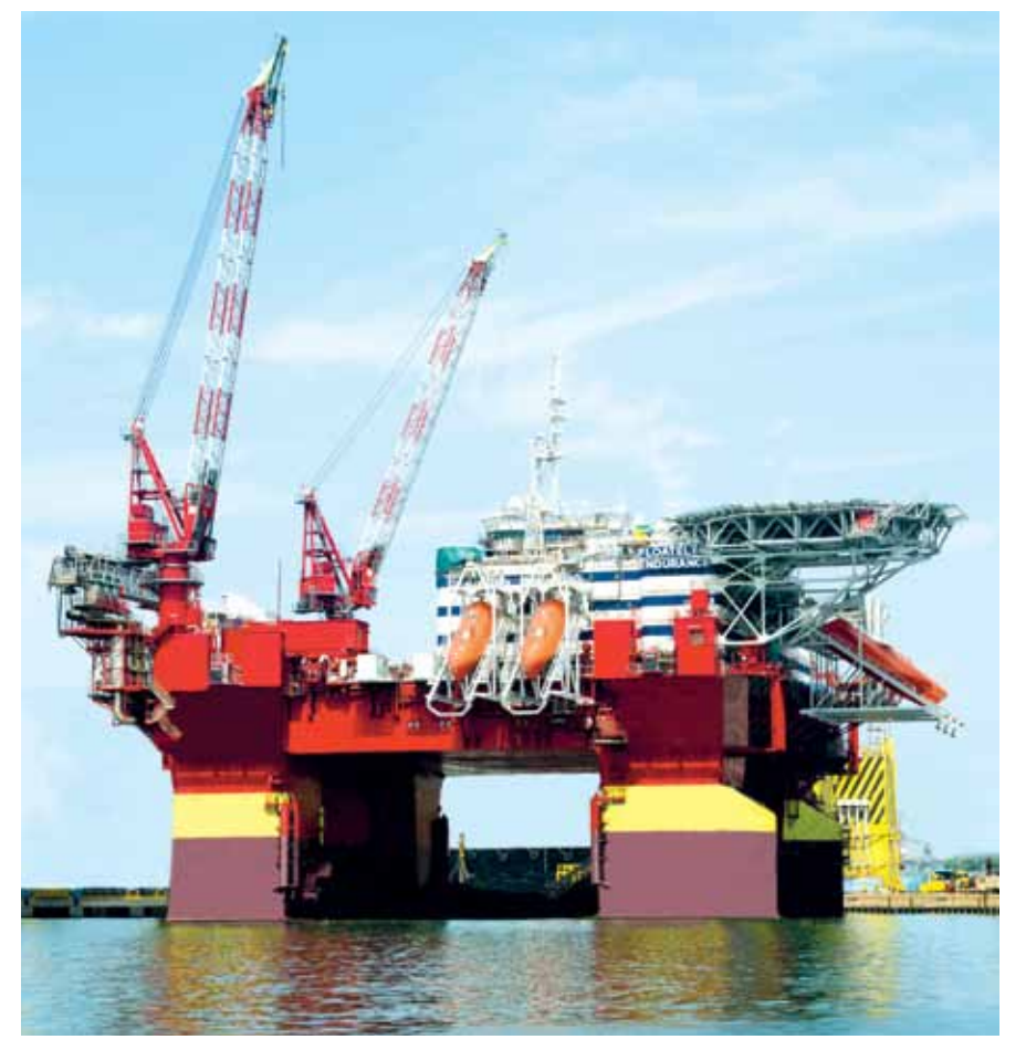
Floatel Endurance is built to Keppel's innovative DSS™ 20NS design which is able to work in the North Sea while at the same time remaining a cost-effective support semi wherever it is deployed

A telescopic gangway ensures the safe transit of personnel to and from the serviced installation. The multi-purpose semi also