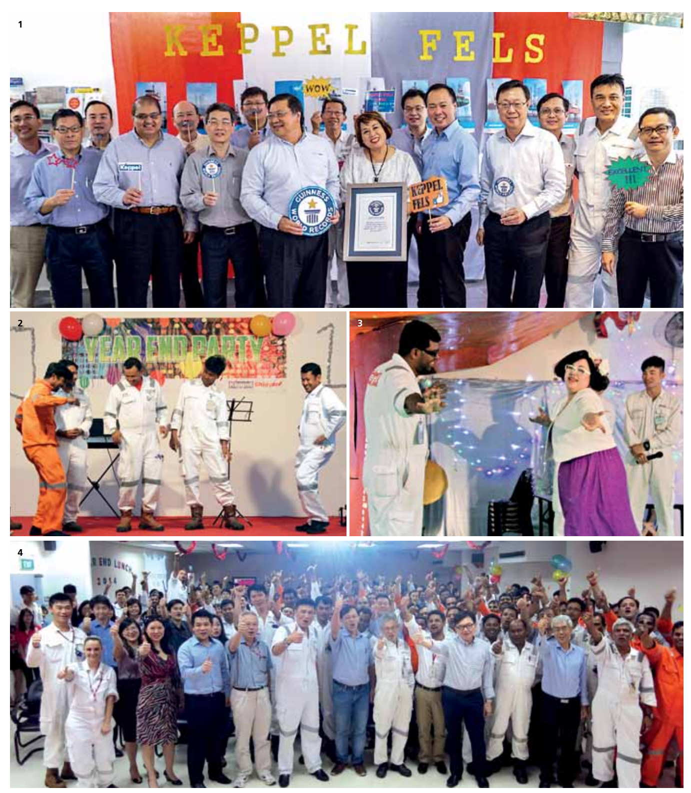
1: Management and employees from Keppel FELS and Keppel Offshore & Marine celebrated achievements and feats of 2014 2&3: Over at Keppel Shipyard, Keppelites grooved into the New Year 4: Keppel Singmarine celebrated in rousing style

There was plenty of shaking and shimmying across the Keppel Offshore & Marine Group as the various business units celebrated the end of a fruitful year in 2014 and welcomed 2015 in style. From showing off slick dance moves to showcasing musical talents, Keppelites had fun making merry with their colleagues.