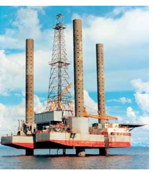
Keppel FELS has come a long way since it delivered its first jackup rig, JW Mclean in 1970

shut down, the company stayed resilient and took a long term view to retain its main workforce and preserve its core competencies.