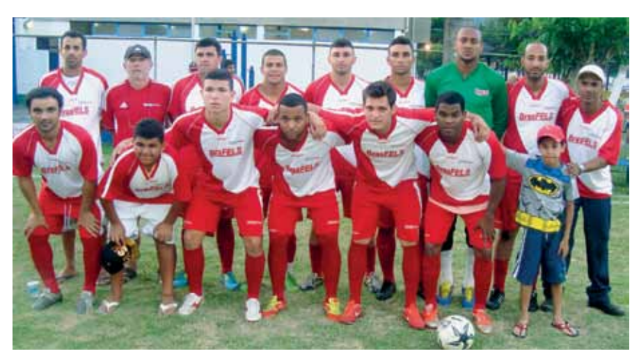
BrasFELS' soccer team were champions of the third PAM (Mutual Aid Plan) Soccer Championship

BrasFELS' Angra dos Reis yard is located.