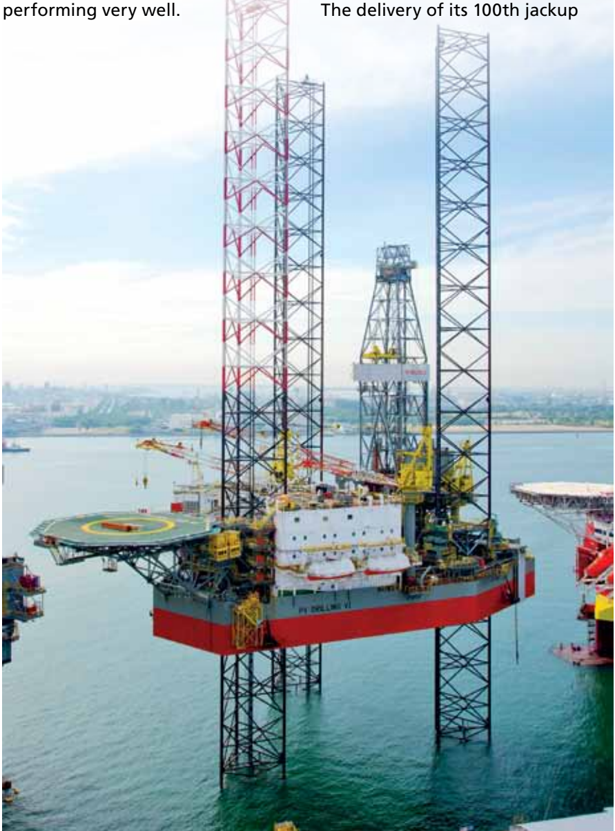
PV Drilling VI is the 100th jackup rig to be delivered by Keppel FELS, a milestone that reaffirms the yard's position as the largest manufacturer of jackup rigs in the world

rig reaffirms Keppel FELS as the world's largest manufacturer of offshore rigs. This follows its recognition by Guinness World Records in 2014 as the 'Largest Manufacturer of Offshore Rigs' for delivering 21 rigs in a year.